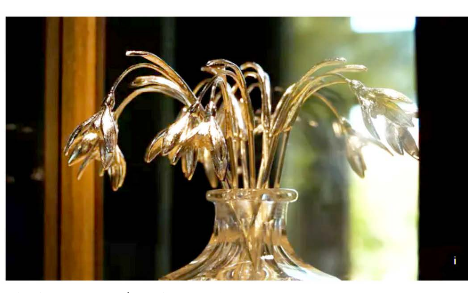
The Flowers are made from silver and gold

The bouquet consists of 118 individual golden pieces, weighing 739 grams in total. It took approximately one month to create. It's placed in a black Moser vase. A private client from Czechia commissioned it to decorate his home.